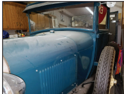
1927 Ford Model T