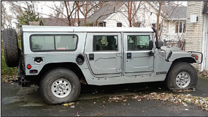
1996 Hummer H1 502SH

INSPECTION: By Appointment Only Please Call Gary Slager at 224-927-5305