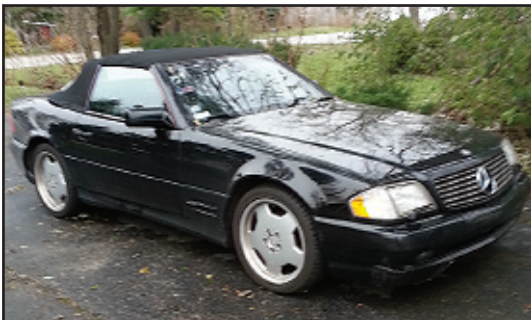
1997 Mercedes Benz SL500