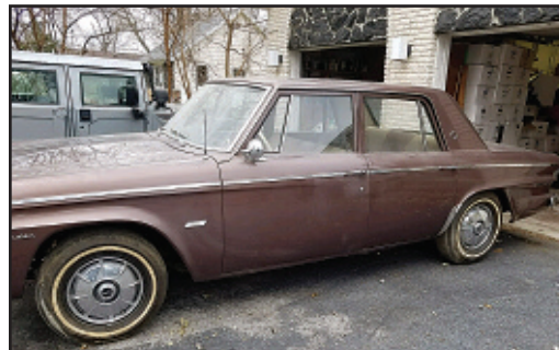
1965 Studebaker Commander 4