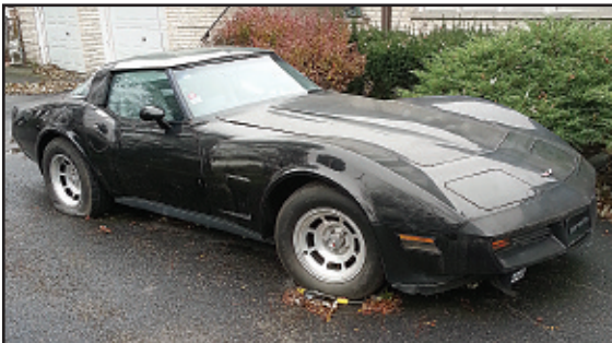
1982 Chevrolet Corvette