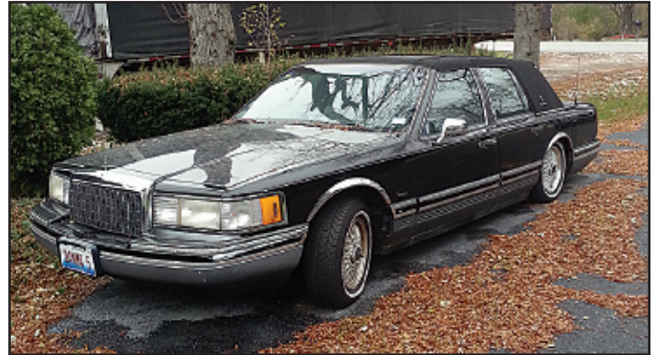
1993 Lincoln Town Car